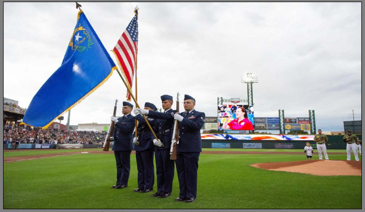
Color Guard Presentation performed at the Greater Nevada Field for the Reno Aces.

Presenting Colors for on-base events such as promotions, retirements, change of command, award ceremonies and etc.