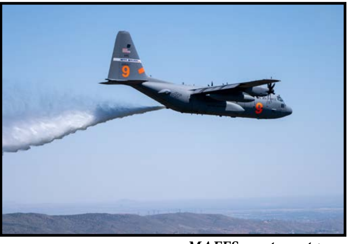
MAFFS, cont. next page