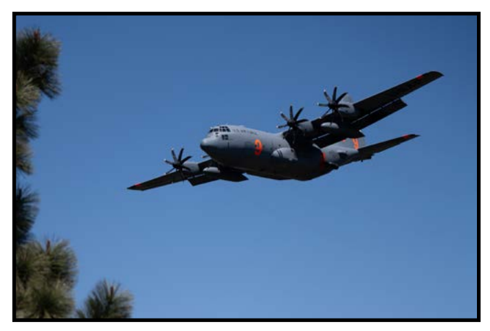
Above and below: a C-130 (MAFFS 9) from Nevada Air National Guard's 152nd Airlift Wing does a dry pass prior to performing a water drop May 8, 2024, during MAFFS Spring Training 2024, hosted by the California Air National Guard's 146th Airlift Wing. This particular part of the training was conducted in the Angeles National Forest near Green Valley, California from May 6-10, 2024.