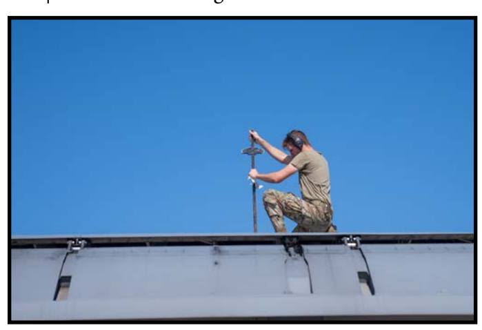
Staff Sgt. Tyler Bell dips the fuel tank to verify fuel level on a Nevada Air National Guard C-130 at Modular Airborne Fire Fighting System (MAFFS) Spring Training May 6, 2024 at Channel Islands Air National Guard Station in Port Hueneme, Calif.