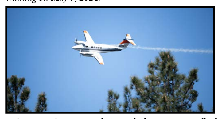
U.S. Forest Service Lead Aircraft dispenses a puff of smoke during MAFFS Spring Training 2024 on May 8, 2024. The smoke helps the trailing aircraft know where to begin and end their line of retardant. The training, hosted by the California Air National Guard's 146th Airlift Wing, was conducted in the Angeles National Forest near Green Valley, Calif. from May 6-10, 2024.