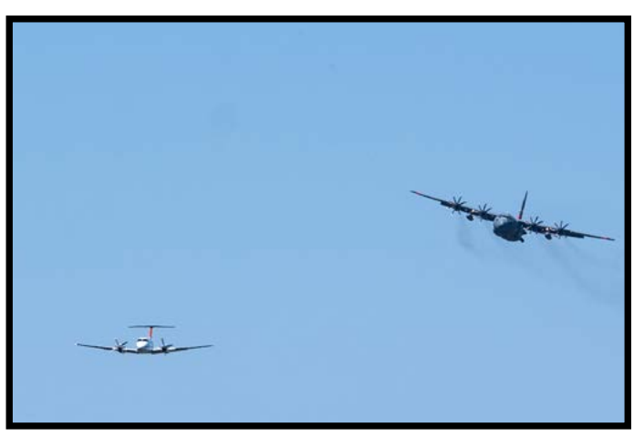
U.S. Forest Service Lead Plane leads a C-130 from Wyoming Air National Guard's 153rd Airlift Wing during Modular Airborne Fire Fighting System (MAFFS) Spring Training 2024, hosted by the California Air National Guard's 146th Airlift Wing.